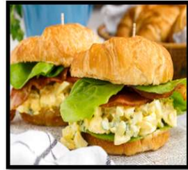
Egg Salad Sandwich with potato salad