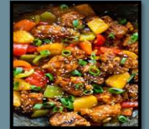
Sweet & Sour Pork