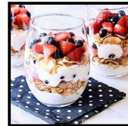
Yogurt Parfait $4.50