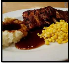
BBQ Ribette with mashed potatoes & corn