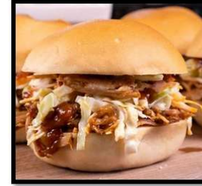
Pulled Pork Sliders with fries