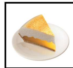
Lemon Meringue Pie $4.50