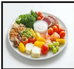
Cold plate with crackers & dip