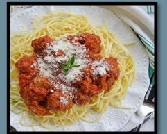
Spaghetti & Meatballs