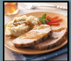
Pork Loin Dinner