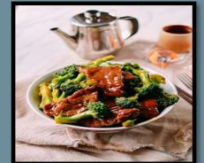
Beef & Broccoli