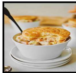
Chicken Pot Pie