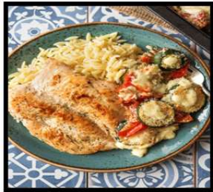
Talapia with lemon orzo