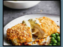
Chicken Cordon Bleu