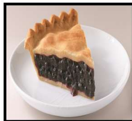
Blueberry Pie $4.50