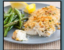
New England Breaded Haddock