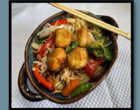
Orange Chicken with Chow mein