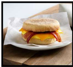
Sausage Breakfast Sandwich $4.50