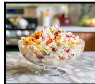
Ambrosia Salad $4.50