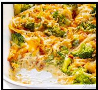
Chicken Bacon Ranch Casserole