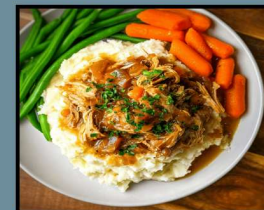
Pulled Pork Dinner