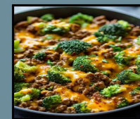
Cheesy Ground Beef Skillet