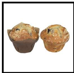
Jumbo Muffin $ 3.00