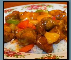
Sweet & Sour Pork