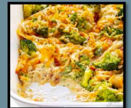
Chicken Bacon Casserole