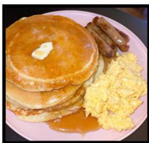
Pancakes, egg, sausage