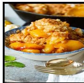
Peach Cobbler $4.50