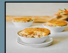
Chicken Pot Pie