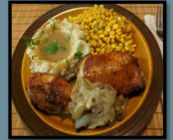
BBQ Chicken Thighs