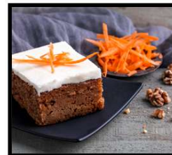
Carrot Cake $4.50