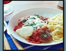
Chicken Parmesan on noodles with garlic bun