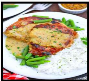
Honey Dijon Pork Chops