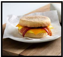
Bacon Breakfast Sandwich $4.50