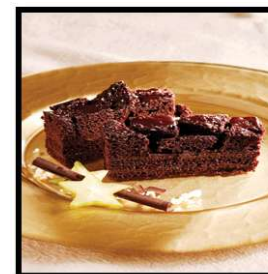
Chocolate Avalanche Cake $4.50