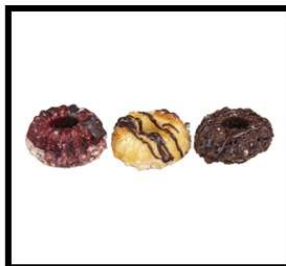
3 Mini Bundt Cakes $4.50