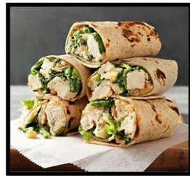
Chicken Ceasar Wrap with potato salad