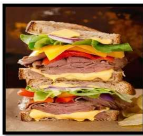
Beef Sandwich with veg & pickles