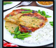
Honey Dijon Pork Chop