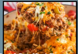
Beef Stuffed Pepper Casserole