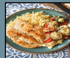
Tilapia with orzo