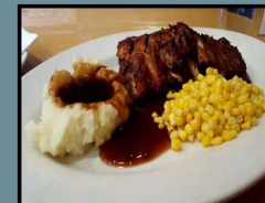
BBQ Beef Ribbette