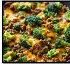
Cheesy Ground Beef Skillet