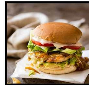
Chicken Burger with fries