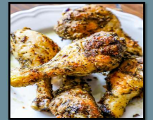
Roasted Greek Drumsticks