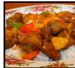
Sweet & Sour Pork