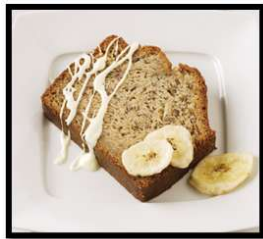
Banana Bread $3.00