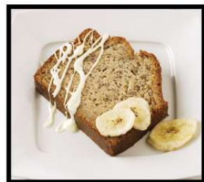
Banana Loaf $3.00