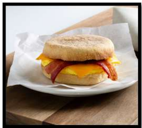
Sausage Breakfast Sandwich $4.50