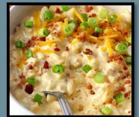
Loaded Mac & Cheese