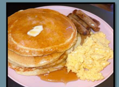
Pancakes, egg, sausage