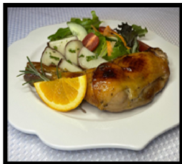
BBQ Chicken Leg, potatoes & vegetables