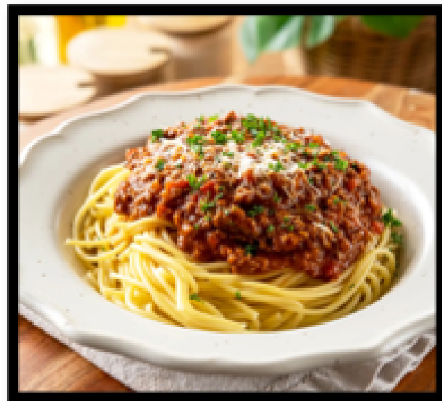
Spaghetti, Meat Sauce & Garlic Toast