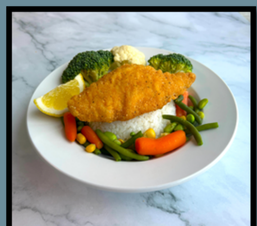
Lemon Pepper Sole