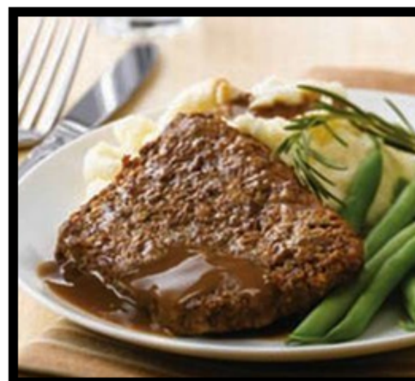
Meatloaf Dinner, potatoes & vegetables