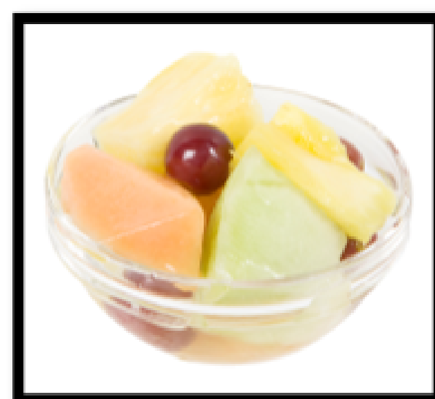
Fruit Salad $4.50