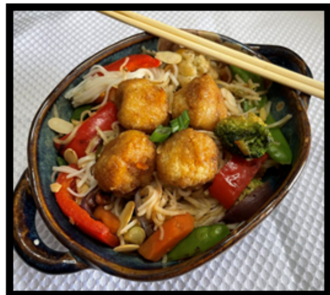
Orange Chicken, Chow Mein & Vegetables