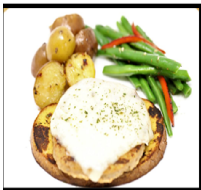
Turkey Patty Melt