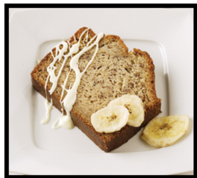
Bananna Bread $3.00