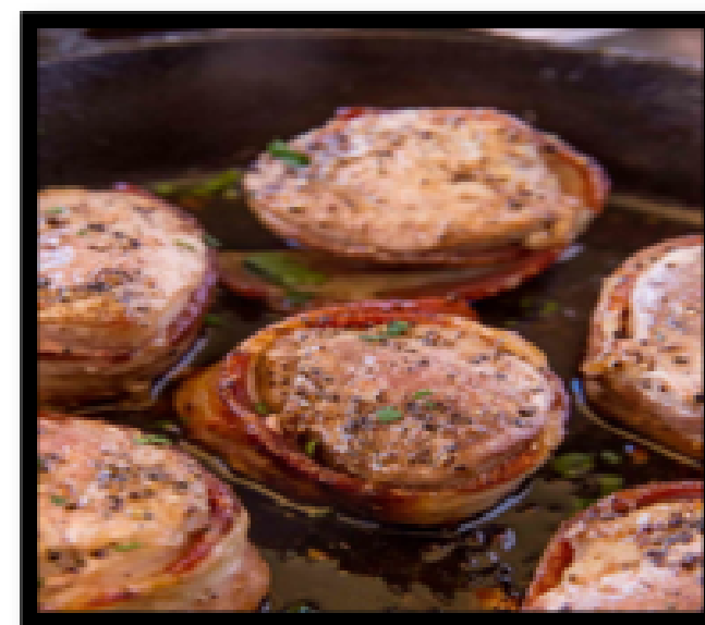
Pork Medallions, Potatoes & Veg