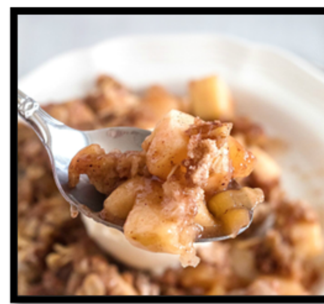
Apple Crisp $4.50