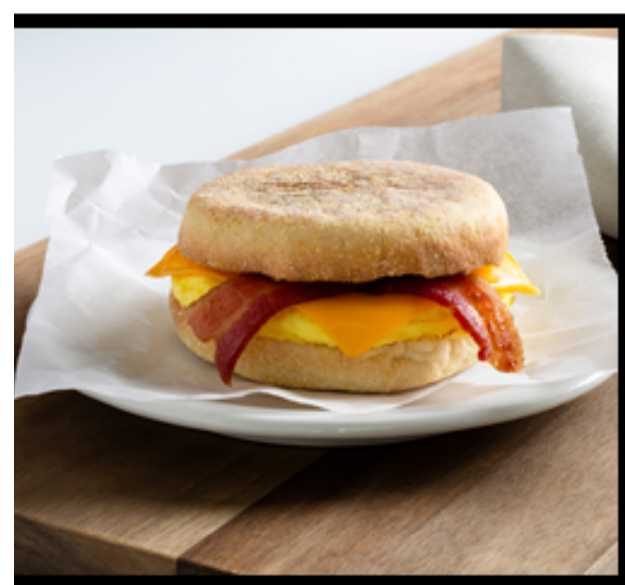
Bacon Breakfast Sandwich $4.50