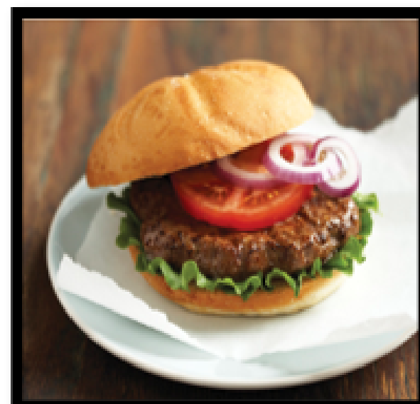
Beef burger & fries