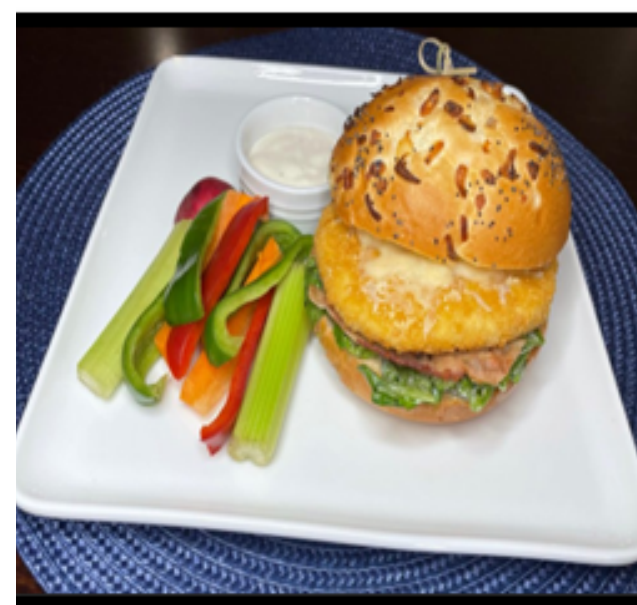
Chicken Caesar Burger