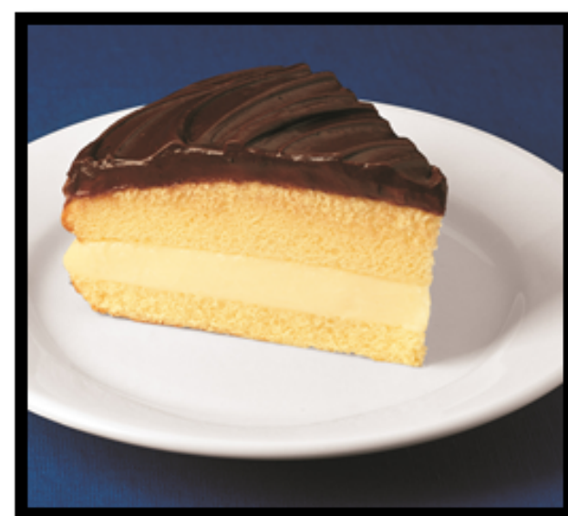
Boston Cream Pie $4.50