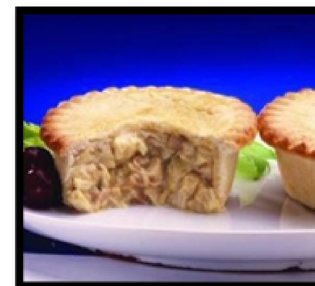
Chicken Pot Pie, mashed potatoes & gravy