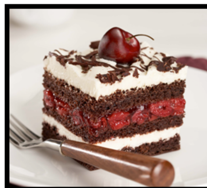
Black Forest Cake $4.50