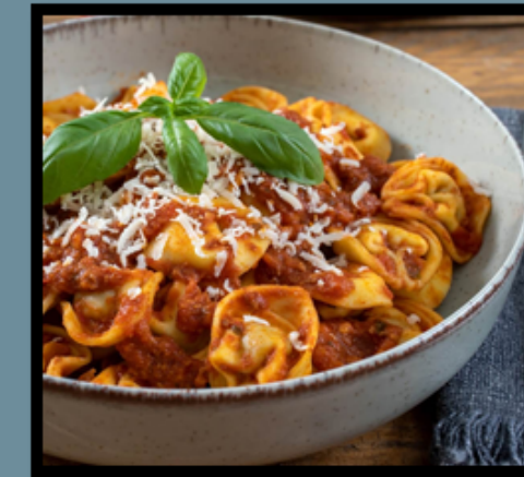
Tortellini & Meat Sauce