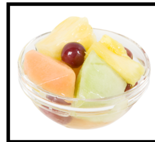
Fruit Salad $4.50