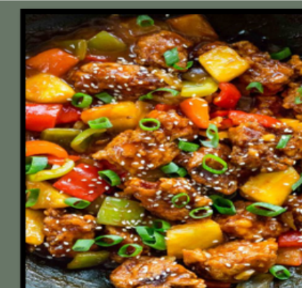
Sweet & Sour Pork