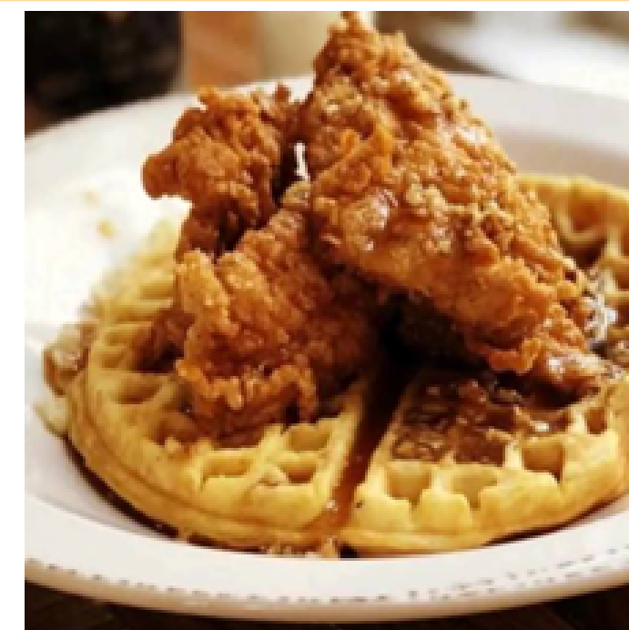
Chicken & Waffles