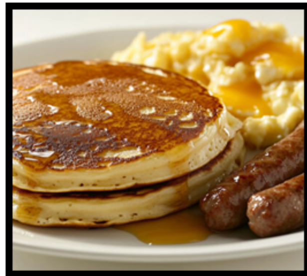
Pancakes, sausage, scrambled eggs