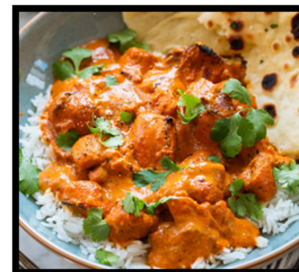
Butter Chicken, Rice, Peas & Naan bread