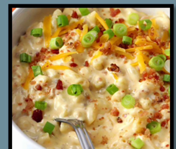
Loaded Mac & Cheese