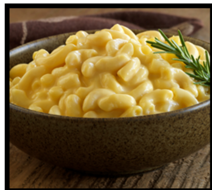
Mac & Cheese $5.00