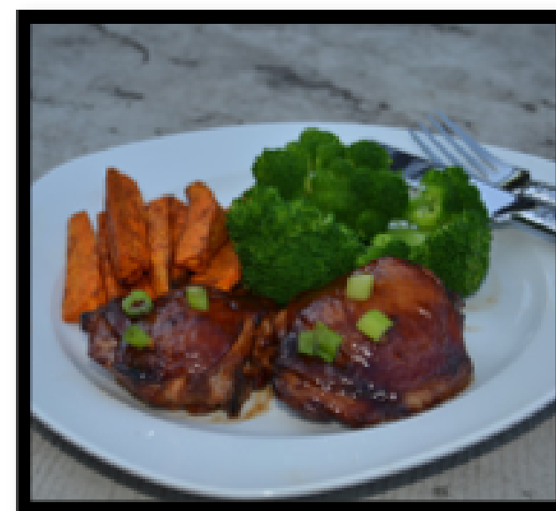
Apricot Chicken Thighs, sweet potato & broccoli