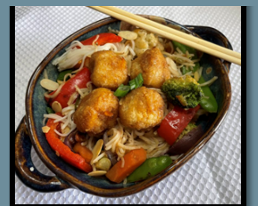
Orange Chicken Bowl