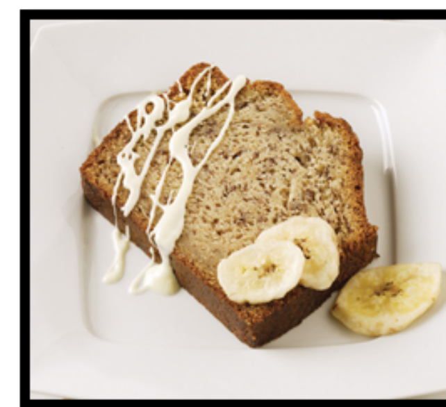
Banana Loaf $3.00