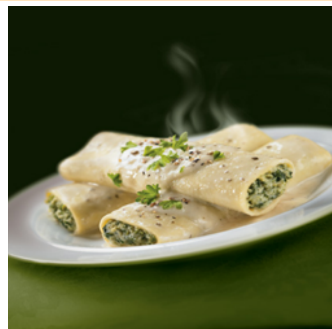
Spinach & Cheese Cannelloni