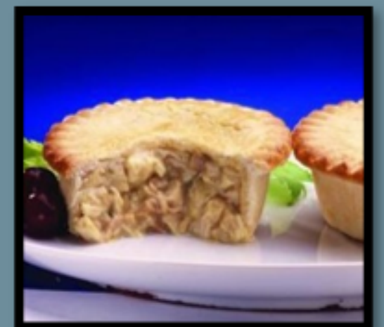
Chicken Pot Pie