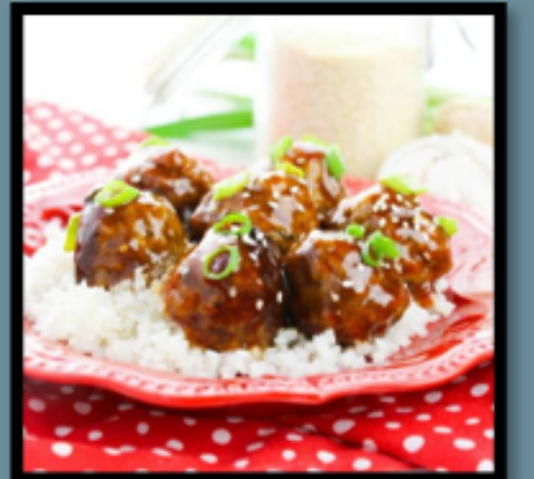
Honey Garlic Meatballs