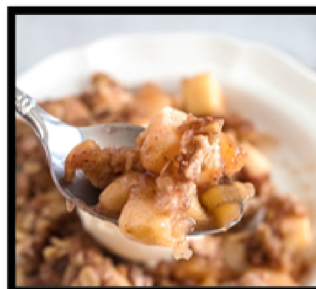
Apple Crisp $4.50