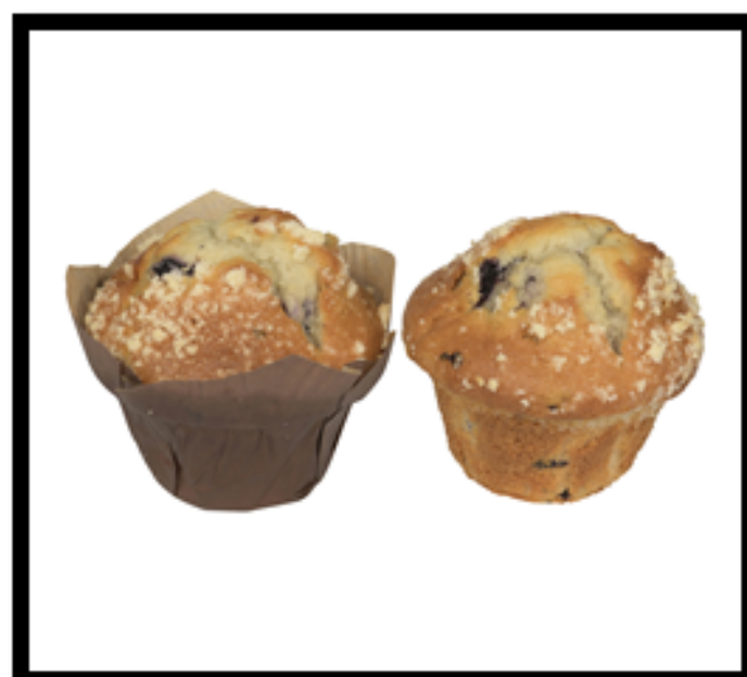
Jumbo Blueberry Muffin $3.00