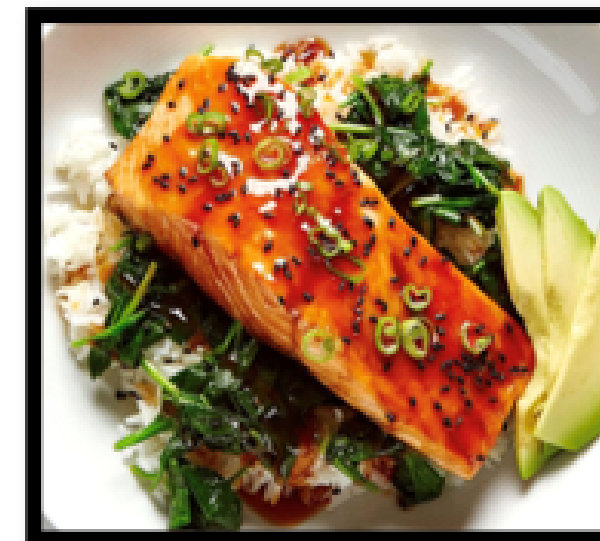
Teriyaki Salmon, potatoes & vegetables