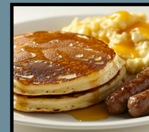
Pancakes, egg, sausage