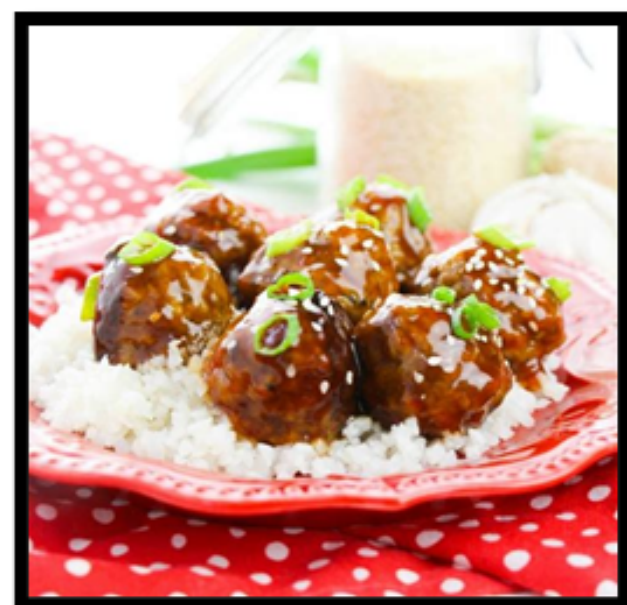
Honey Garlic Meatballs