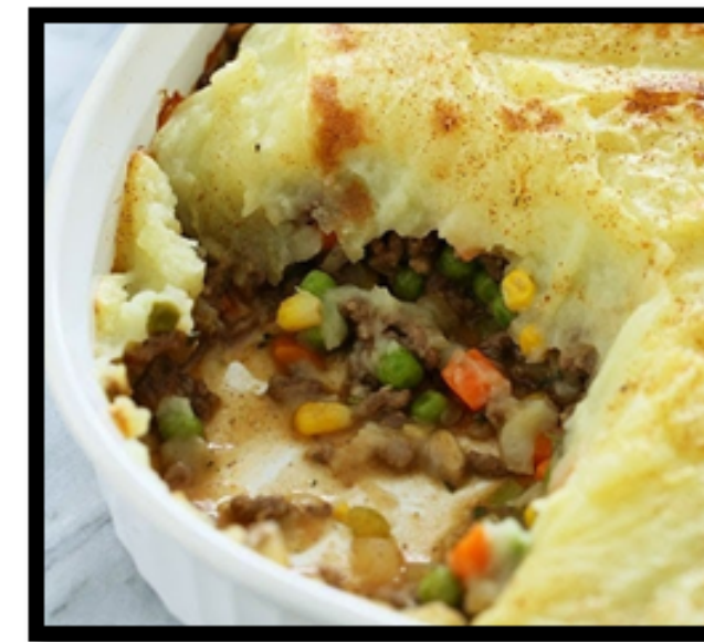
Shepherds Pie & Biscuit