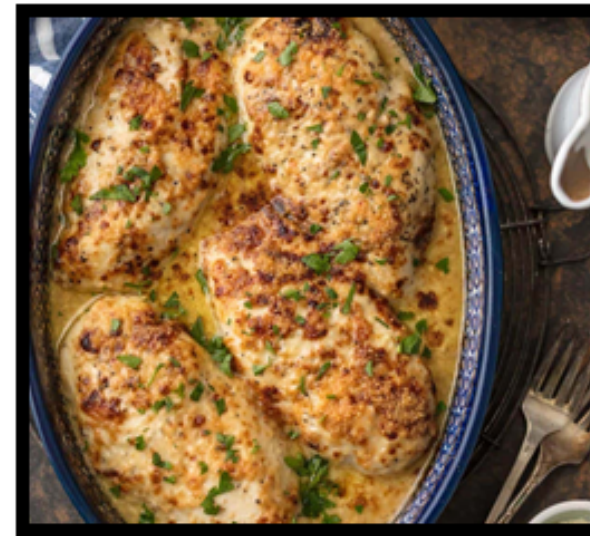
Chicken Ceasar Bake, rice & veg