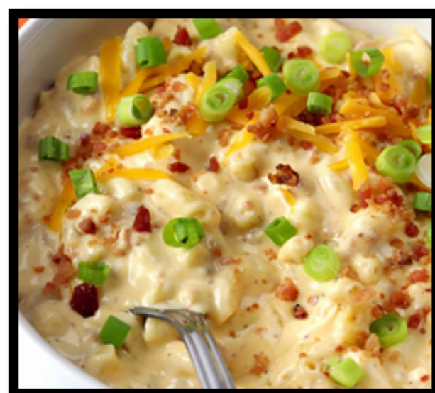
Loaded Mac&Cheese- Bacon, Gr. Onions, Cheese & Sour Cream