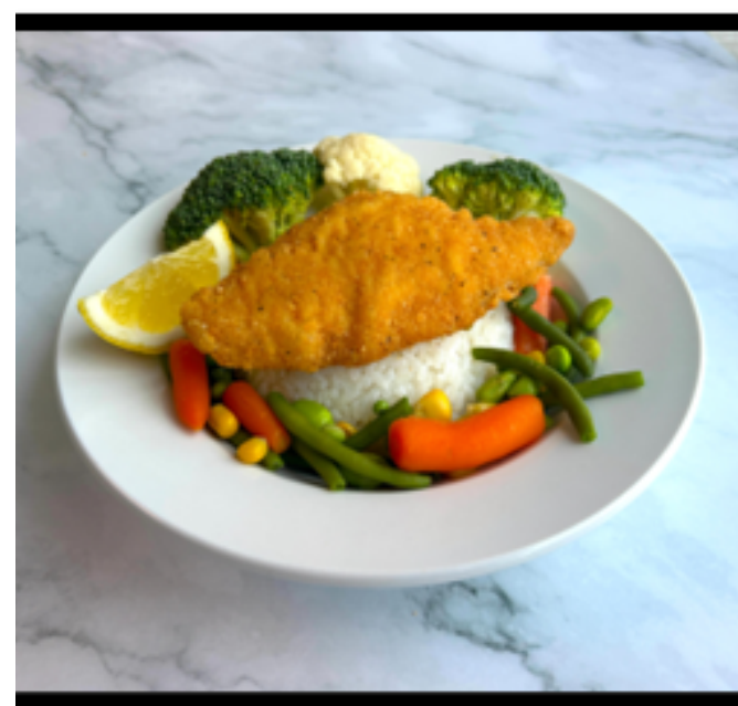
Lemon Pepper Sole