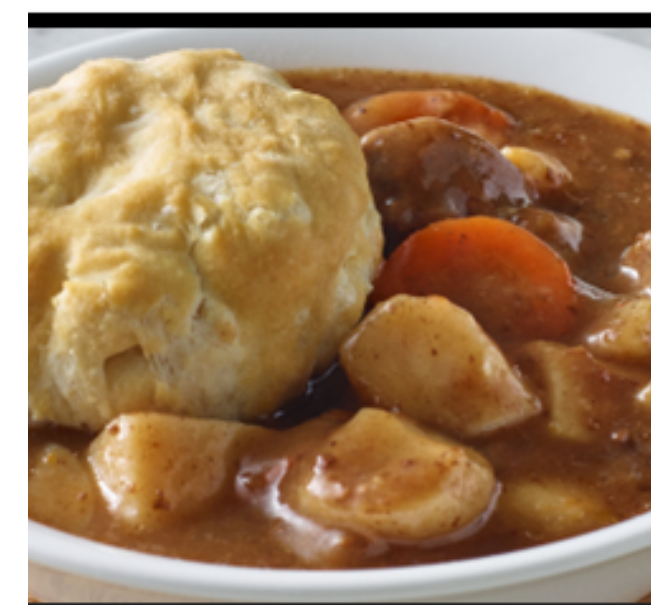
Beef Stew & Biscuit