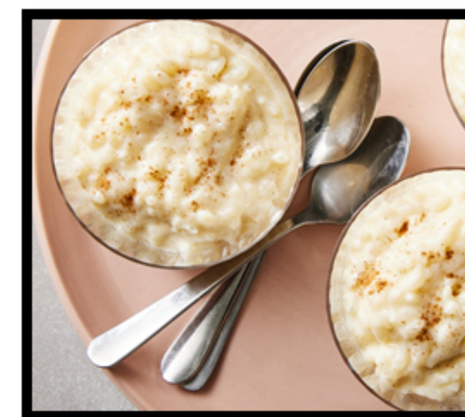
Rice Pudding $4.50